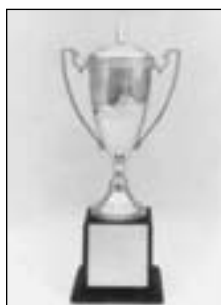
Harry Wills Trophy PHRF C

1st Warning Signal: 11:55 a.m. both days