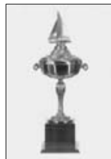
Frank Dair Trophy PHRF B

Midwinter 2012 T-Shirts are Available From Your Host Yacht Club