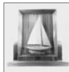
Kenneth E. Street Memorial PHRF A

Don't Be Disappointed - Order Your T-Shirt Today!