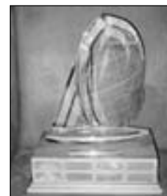
SBYRC Sport Boat Sport Boat

Don't Be Disappointed - Order Your T-Shirt Today!