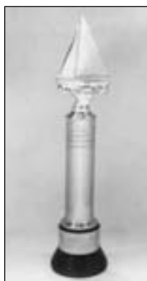
Midwinter Snipe Class Snipe